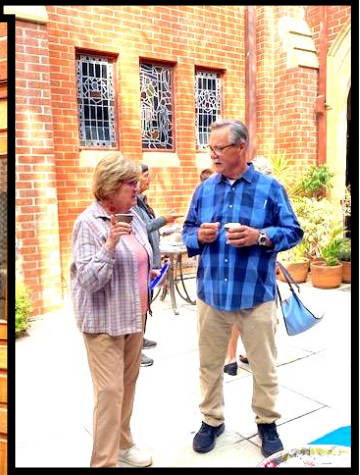
Celebrating Pastor Appreciation Day on October 13th